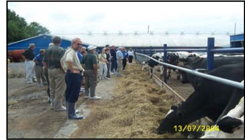
Visit to a barnyard runoff control project during the Agriculture Adaptation Council Tour, July 13 th , 2004.