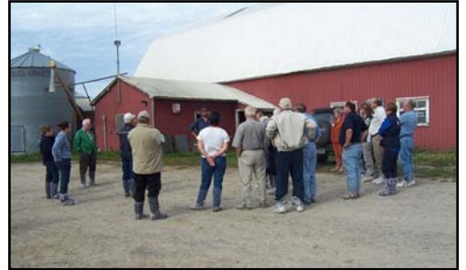
Visit to a dairy farm during the SNC Fall Watershed Tour, September 21 st , 2004.

SNC used the EOWRC funding to offer a fall watershed tour highlighting several projects that were completed through the Clean Water Program, water quality monitoring initiatives and other projects implemented by SNC. SNC also utilized the funding to produce and distribute new SNC “partnership” signs that were distributed to interested landowners who completed projects through the Clean Water Program.