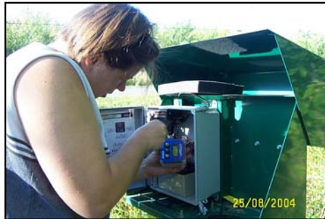
SNC staff maintaining telemetry unit on a PGMN well.

In 2001 and 2002, the MOE hydrogeologists and SNC staff identified 15 sensitive groundwater areas of concern within the SNR watershed that would be incorporated into the Provincial Groundwater Monitoring Network (PGMN). An additional area of concern was identified north of the SNR watershed, and was also added into SNC's commitment to PGMN.