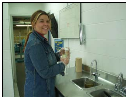
SNC staff collecting a water sample from the Casselman water treatment plant intake.

A major 4-year water quality study is being undertaken in the Provinces of New Brunswick, Alberta, and Ontario. The South Nation River watershed has been selected as the study region representing the Province of Ontario. This research project is being coordinated by SNC's Clean Water Committee in partnership with Agriculture & AgriFood Canada (Ag Canada), and Health Canada.