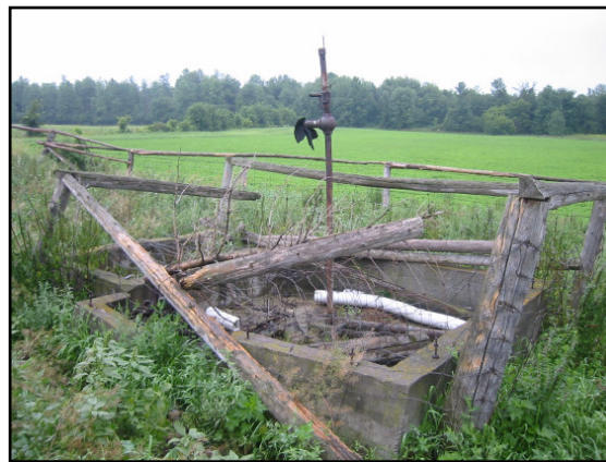
An example of an abandoned well that is being decommissioned with the EOWRC funding.

SNC delivered grants to landowners within the EOWRMS study area to properly decommission abandoned wells. The grant rate was 100% of the total costs to a maximum of $500/well. The grants were delivered through the Clean Water Program in the SNR watershed and by SNC staff in the remainder of the EOWRMS area. The EOWRC funding was also utilized by the Ottawa Rural Clean Water Program to supplement grants in the City of Ottawa portion of the EOWRMS area.