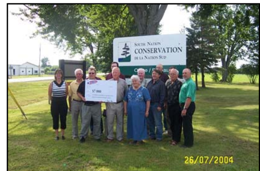
2004 cheque ($7,000) presentation to Clean Water Committee from St. Albert Cheese.

In 2004, St. Albert Cheese committed to a 3-year, $21,000 contribution to the Clean Water Program. The first $7,000 instalment was presented at the July 26 th Clean Water Committee meeting.