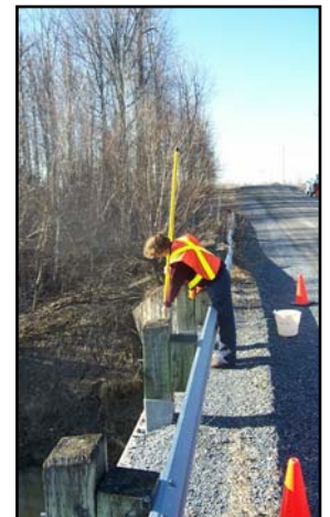
SNC staff collecting a surface water quality sample from a bridge using a sampling pole.

SNC collects surface samples at thirteen sites throughout the watershed on a monthly basis when the watercourses are free of ice. These samples are tested at the Ministry laboratories