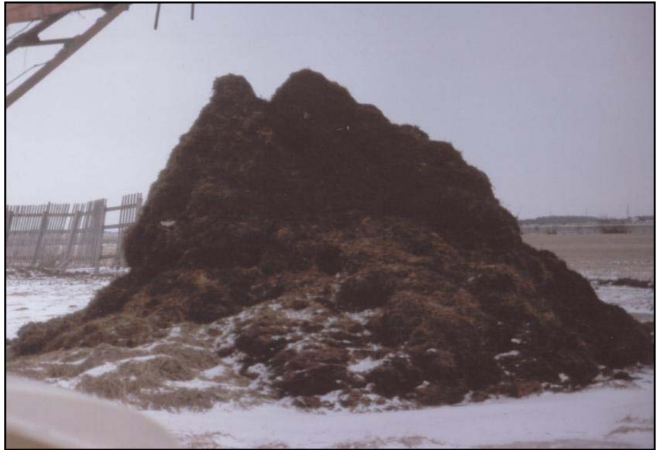
Manure storage - Before