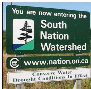
“Conserve Water, Drought Conditions in Effect” signs posted with bilingual SNC boundary signs throughout the watershed, 2002.

In 2000, the provincial government prepared a response plan to deal with low water conditions. This led to the creation of Water Response Teams (WRT) to monitor water levels and encourage voluntary water conservation practices in their area through education and publicity.