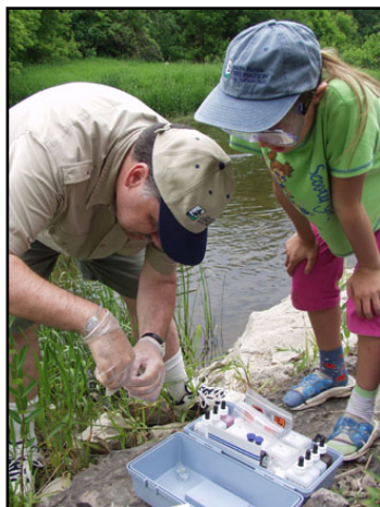
A volunteer family sampling their local stream using a RiverWatch kit.

SNC re-established the volunteer RiverWatch Program in 2004. With financial assistance from R.W. Tomlinson Ltd., SNC purchased 6 new and improved test kits for surface water sampling. These kits were distributed to returning and new volunteers to the RiverWatch Program. With training provided by SNC, volunteers sample their local site monthly, during ice-free conditions. Data gathered through this program is used to augment water quality data collected through the PWQMN and Watershed Characterization monitoring networks.