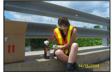
SNC staff collecting a pesticide sample from the Little Castor River.

Environment Canada initiated a national project to document the concentrations of some commonly used pesticides in surface waters of Canada. In 2004, SNC was approached to participate in this project. Samples were collected at 1 site on the Little Castor River; this site was selected because it is part of the Microbial Source Tracking (MST) water quality monitoring program. Three in-use pesticide groups will be analyzed, including organophosphorus insecticides, triazines and phenoxy-acid herbicides.