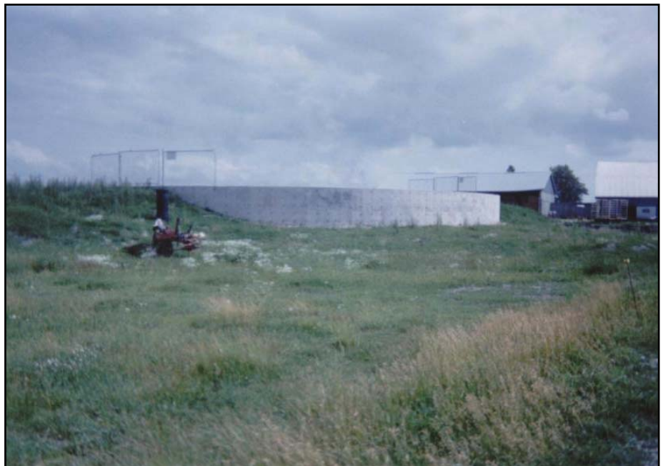
Manure storage - After