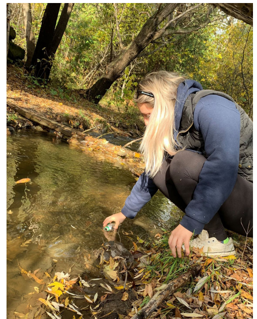
SNC staff collecting water samples at Andy Shield Park in Greely

Approved $197,593 in cost-share grants to residents for 94 projects to control the invasive emerald ash borer (EAB) while maintaining urban tree cover. SNC remains committed to controlling EAB within its forest properties by removing infected Ash trees.