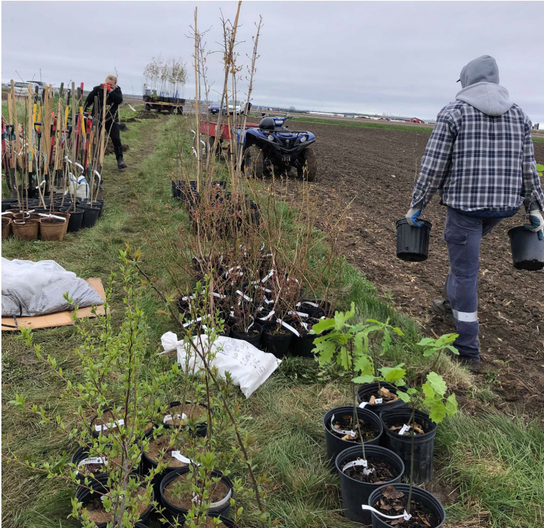
Students and SNC staff planting an edible tree buffer in St. Isidore

SNC worked with the landowners and 5 secondary schools to arrange demonstration planting events for over 100 students receiving Specialist High Skills Major Certifications towards their high school diplomas. This project was undertaken with the financial support of the Government of Canada.