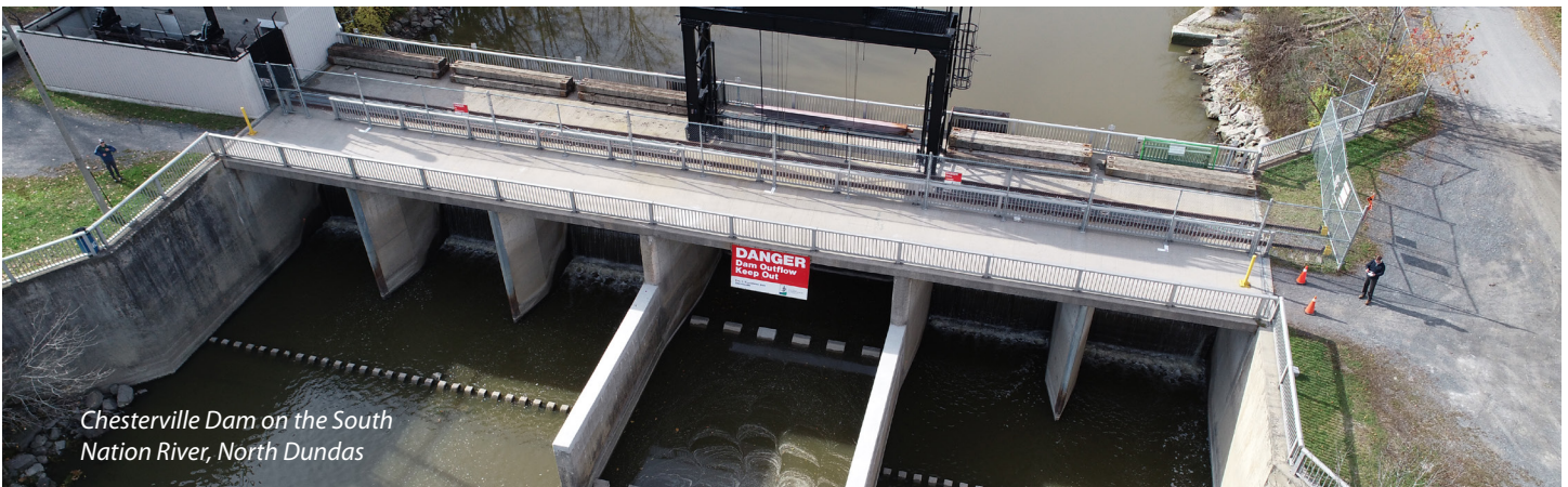
Chesterville Dam on the South Nation River, North Dundas

Federal and Provincial funding supports a half million-dollar upgrade to the Chesterville Dam