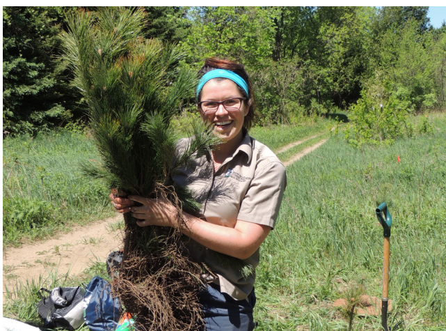
SNC staff planting trees as part of our Forest Conservation Initiative