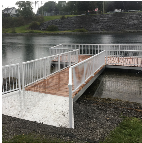
New dock installed in Cardinal on the St. Lawrence River