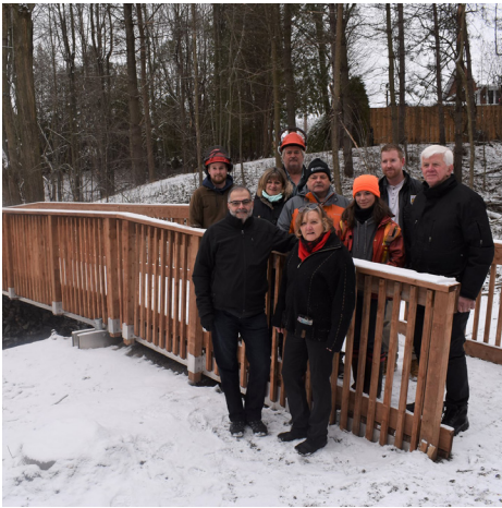
New bridge at J. Henry Tweed Conservation Area

2019 was a year of many CA upgrades! Improvement highlights included: a new bridge at J. Henry Tweed along with new trees being planted, a new dock installed in Cardinal and maple sap pipelines installed at Oschmann Forest.