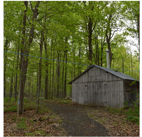
Maple Sap pipelines at Oschmann Forest Conservation Area