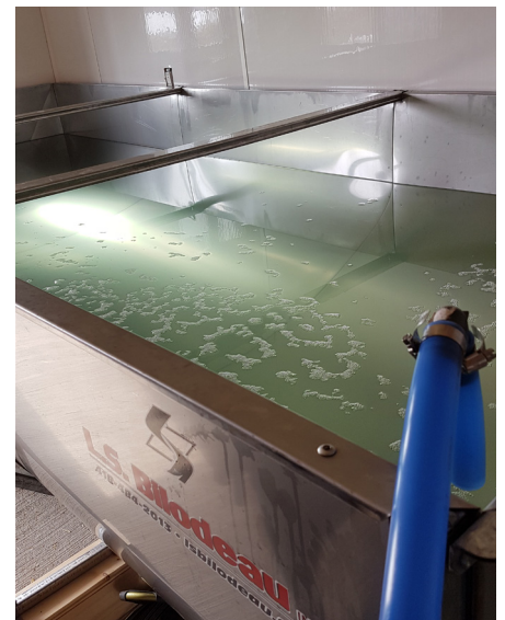
Pumphouse at Oschmann Forest Conservation Area, North Dundas

30 acres of SNC land is leased to local farmers.