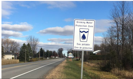
Source Water Protection Signage, Finch