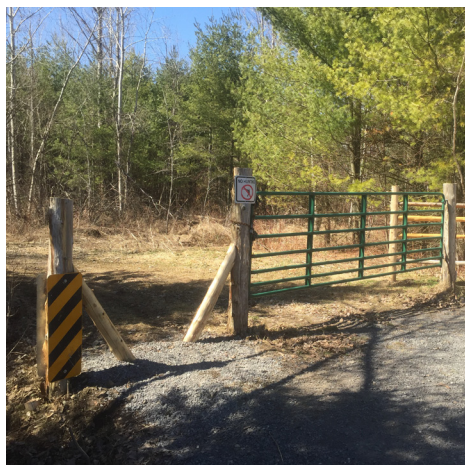
Warwick Forest Conservation Area, in Berwick

2016 was a year of many CA upgrades! Some of the improvements include: 2 new bridges at Two Creeks Forest CA, new horse fencing at Warwick Forest CA, new accessible dock at High Falls CA, 10 partnership docks maintained, and interpretive signs installed along the Findlay Creek Boardwalk in Ottawa.