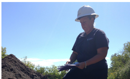
SNC Septic Inspection, North Dundas

In 2016, our monitoring efforts guided over 5 restoration projects to improve water quality, stream flow, protect people and property and enhance ecosystems including sites at Shields Creek and along the Castor River in the City of Ottawa.