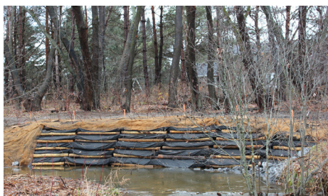
Cedar Crib Bed, Shields Creek, City of Ottawa

In 2016, over $7,000 in grants were awarded to community groups across the jurisdiction to support local fishing derbies, festivals, agricultural events, canoe and kayak runs, and heritage events.