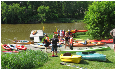
Chesterville Kayak Club, South Nation River

The Geoportal can be accessed on SNC’s homepage at www.nation.on.ca .