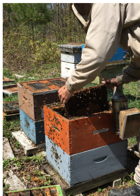
SNC staff experienced bee keeping first-hand at Ambrosia Apiaries, in Berwick.

30 acres of SNC land is leased to local farmers.