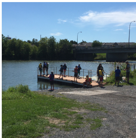
High Falls Conservation Area, in Casselman