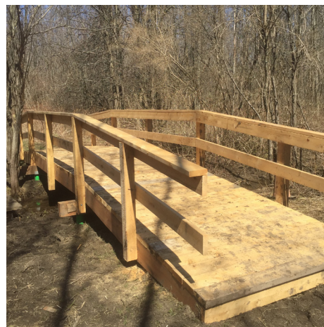
Two Creeks Forest Conservation Area, in Iroquois