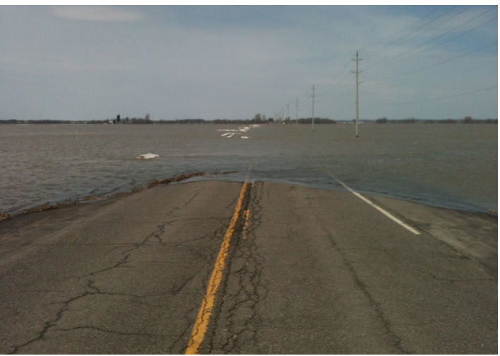
Flooding at Seguin Bridge, Cty Rd 9, April 10, 2012

SNC uses this analysis to predict the flood potential and issue the appropriate message.