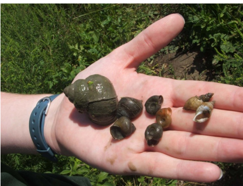
Live creatures, dumped by owners who are no longer prepared to care for them, can carry diseases to native species while competing for food and habitat.

In 2011, SNC fisheries staff discovered Chinese mystery snails in a Winchester drain, and a red-eared slider turtle in the Payne River near Finch. Also called rice snails, the more commonly known mystery snails grow very large and can be present in high densities, clogging water pipes and inhibiting flow. They compete with native snails for food and space. The snails were found in an area stretching from the Gypsy Road culvert south of Winchester to the culvert on County Road 3 north of the village; the highest snail density is within the village itself. The most likely explanation is that