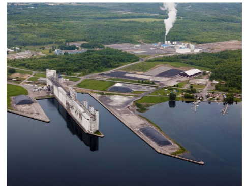
An overhead view of the Port of Prescott. The Port of Prescott is the only deep water port between Montreal and Toronto.

across from it. Edwardsburgh-Cardinal was keen to rely on the expertise of SNC for environmental project management for the expansion of the Port. SNC’s involvement on the Project has resulted in significant cost savings for the Municipality.