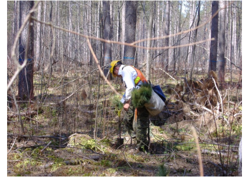
There are many opportunities available to plant trees in the South Nation Watershed. Call our office to speak with one of our foresters.

been funded by the Ontario Trillium Foundation and the United Counties of Prescott-Russell, S.D. & G. Certified Forest Owners, Boisés Est, and the Raisin Region and South Nation Conservation Authorities are all active partners in the program. The service is based out of SNC's office in Finch and is available by calling 1-877-984-2948 extension 285. The WAS technician has visited over 48 property owners since the program started in 2010. SNC foresters currently manage approximately 19,000 hectares of forested land including the forests of SD&G, Prescott-Russell, in addition SNC forests. All forest properties managed by SNC are certified forest under the International Forest Stewardship Council, or FSC Certified.