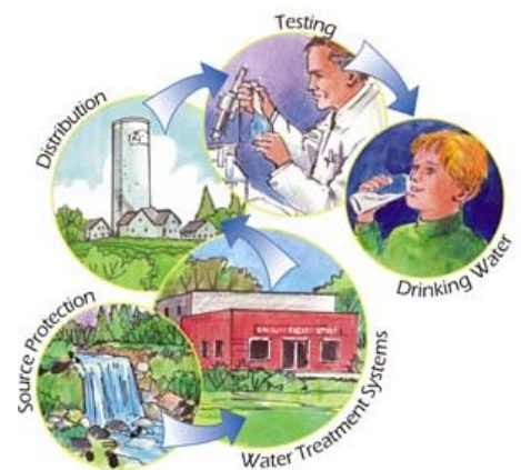
Source Protection considers protecting municipal drinking water at its source in the natural environment

jects were also completed with provincial funding with local property owners. The projects will help protect water sources in Protection Zones. The key to source protection work is its local focus and local solutions. South Nation Conservation and Raisin Region Conservation Authority have worked together with the provincial government, First Nations, municipal politicians, planners, water treatment plant operators, businesses, community groups, and agriculture to identify local solutions that make sense. Many watershed Municipalities have expressed interest in working with SNC in the delivery and implementation of their local Source Protection Plan.