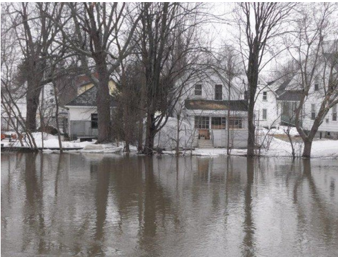
This photo was taken in the Village of Chesterville in the Municipality of North Dundas, showing high water levels on the South Nation River during 2011.

The ability of our watersheds to adapt to changing climate conditions, unpredictable weather, and associated flood threats directly impacts the safety, security, and economic well-being of residents. Protecting homes and people from the dangers of flooding and erosion is a key priority upon which Conservation Authorities are based. SNC works with municipalities and property owners to help people and places prepare for high and low water levels. Eleven Flood Safety Bulletins were issued in 2011 to warn residents of Spring run-off and heavy rainfall events. While no major flooding was observed, SNC staff monitored conditions closely throughout the year using a network of monitoring stations and snow surveys. After a normal spring melt, watersheds dried out con-