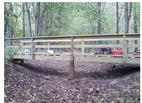
The photo above shows a new bridge installed at Two Creeks Conservation Area near Iroquois. The many upgrades made to this Conservation Area in 2011 will allow residents to take full advantage of the natural beauty of this Property.

are evident. Improvements undertaken in 2011 include: a parking lot expansion with addition of 120 tonnes of gravel; 4.5 kms of marked trail with addition of 150 tonnes of gravel; and two new foot bridges. SNC offers special thanks to South Dundas for their contributions. SNC maintains 7 Conservation Areas and a number of trails and river access docks for the use and benefit of watershed residents. These areas are perfect spaces for family friendly activities. At Two Creeks, hunting and motorized vehicles are not permitted, but hiking and cross-country skiing are welcome.